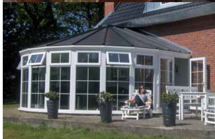
Vertex tiled effect conservatories

Choose from a range of styles to enhance your home